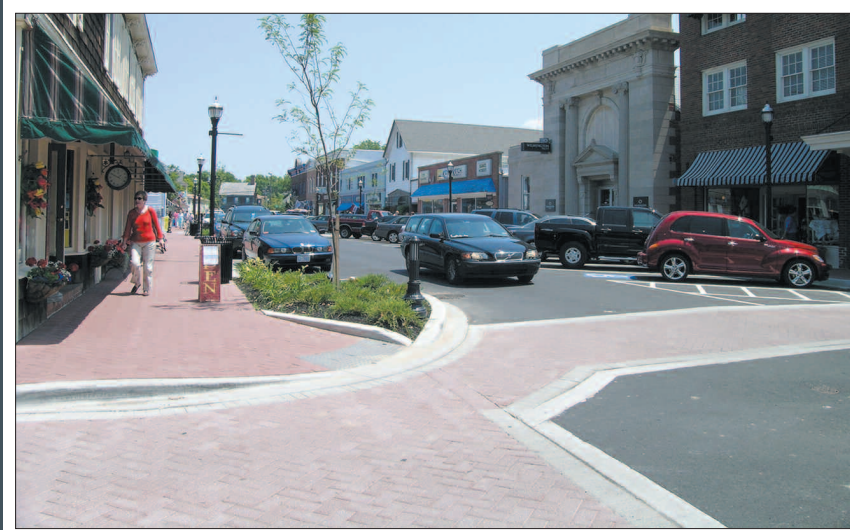
SECOND STREET REVITALIZATION

M U N I C I P A L / C I V I L E N G I N E E R I N G